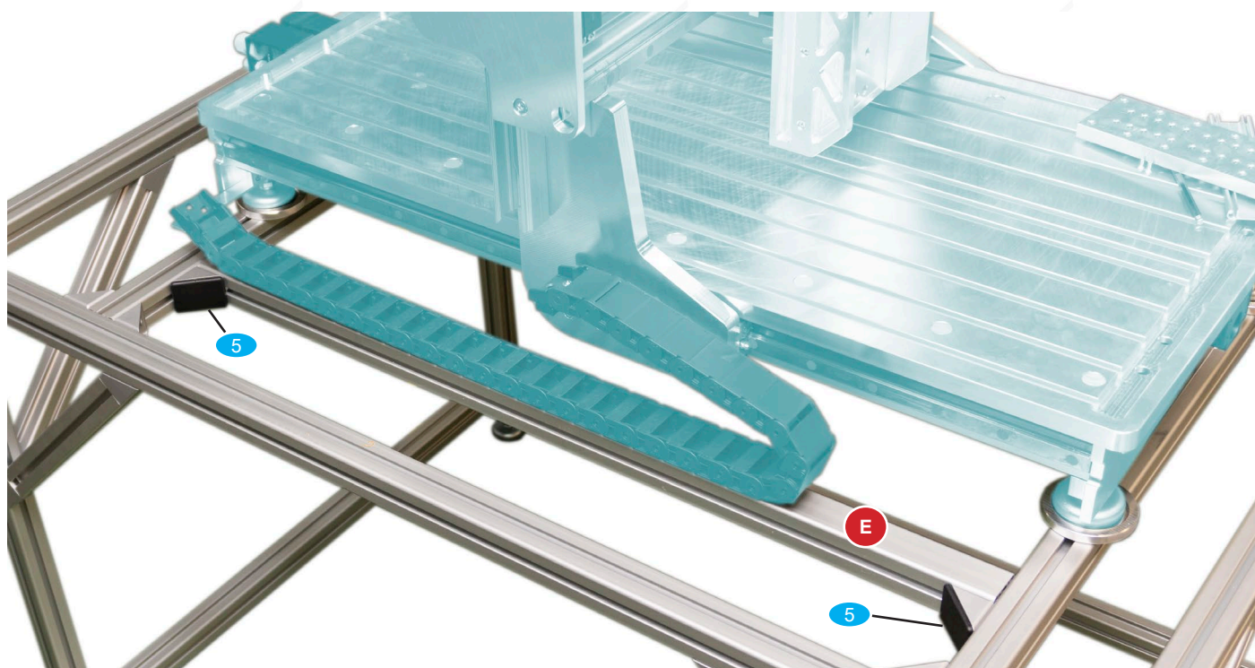
Image 2: The drag chain support consists of two additional angles 5 and the closed at the top support strut E. The machine shown is not included in the scope of delivery and is only shown for better understanding.

First place the machine on the substructure if this has not already been done. To install the drag chain support, the two brackets 5 are initially screwed together loosely.